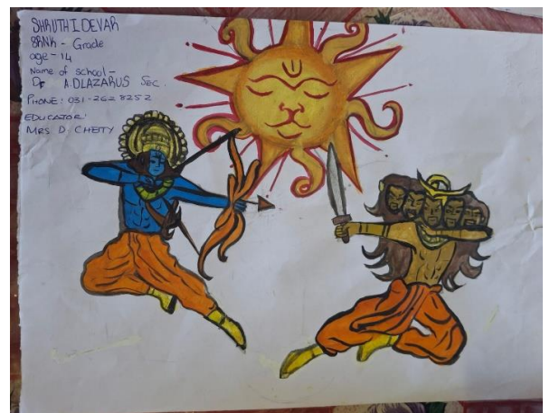
Shruti Devar Gr 8

We're still buzzing from the incredible talent showcased at our recent Creative Arts Competition! This year's event was a resounding success, filled with inspiring performances, stunning artwork, and captivating storytelling.